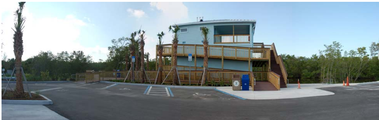
Outdoor Activities Center